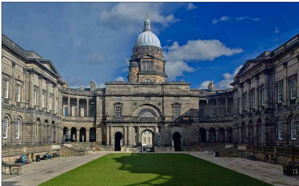
University of Edinburgh

One indispensable part of academic training is to attend large conferences where hundreds of academics present their work. It is enriching to experience a wide variety of approaches and view points, ranging from North Korea's nuclear programme to Europe's sovereign debt crisis. The best however is to present your own work, get valuable feedback and meet interesting people with common interests.