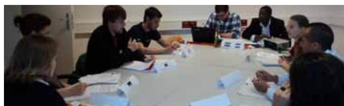
Cross section of the simulation game, 13 June 2012

After a long controversial debate on the content and nature of a new agreement, the simulation game proceeded with concluding statements after which a discussion and acceptance of the final text of the agreement followed. The student leaders then held a press conference to announce what the negotiations had achieved for their two continents.