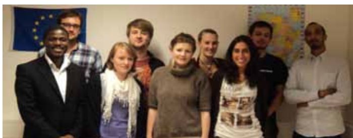
Course participants and EXACT Fellows

The aim of the course has been to introduce students to the basic institutional configurations and policy fields of EU external relations with special attention to EU-Africa relations in the fields of development, trade, or migration.